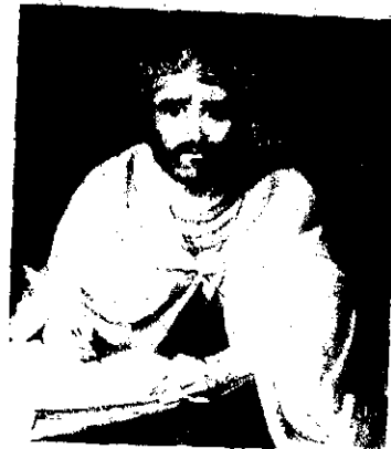
New York Public Library. King John.